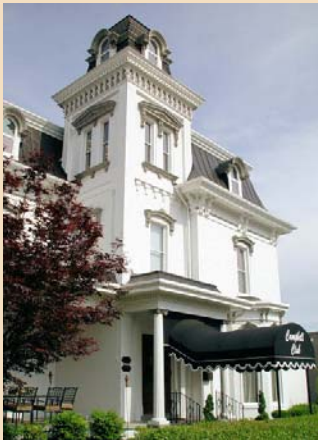
Campbell Club, built circa 1880