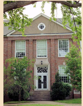
Longfellow School, erected 1931